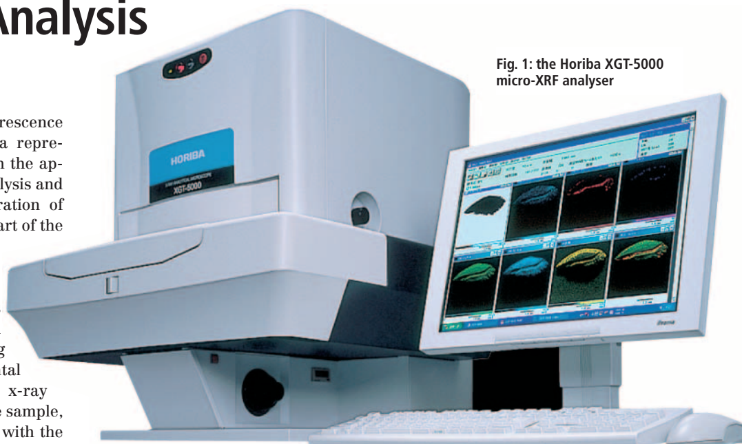
Fig. 1: the Horiba XGT-5000 micro-XRF analyser

This coming of age of micro-XRF in the form of the XGT-5000 has seen re-